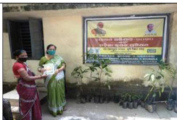
KVK Sundargarh II