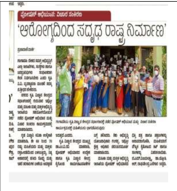
KVK Gangavathi (Koppal) newspaper coverage on Poshan abhiyana