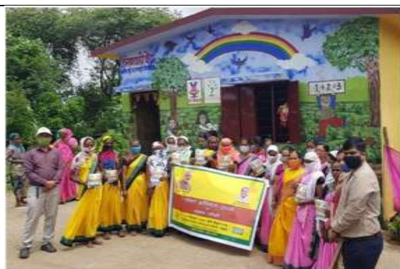
KVK Nashik-I distributing Seedlings and planting material to the anganwadi workers.