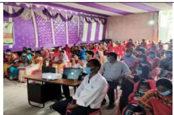
KVK Muzaffarpur Additional