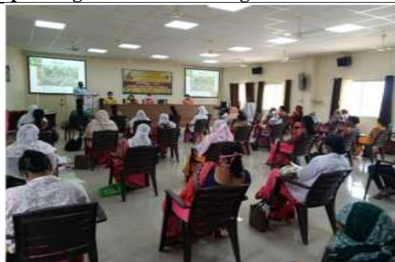
KVK Pune-IIdelivering lectures on poshan importance to anganwadi workers.