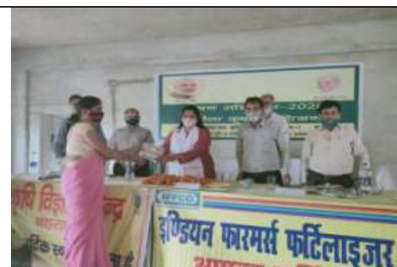
Seed Distribution by KVK Bahraich