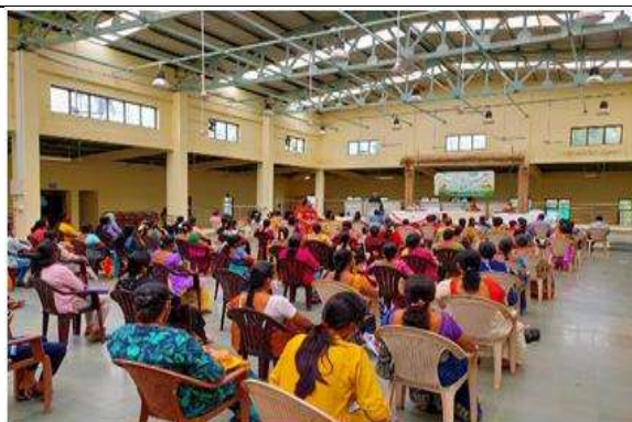
KVK North Goa