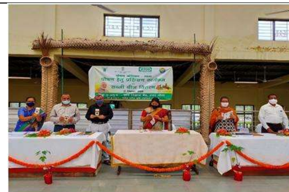
KVK North Goa