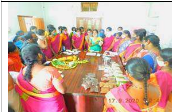
KVK Mahabubnagar (YFA)