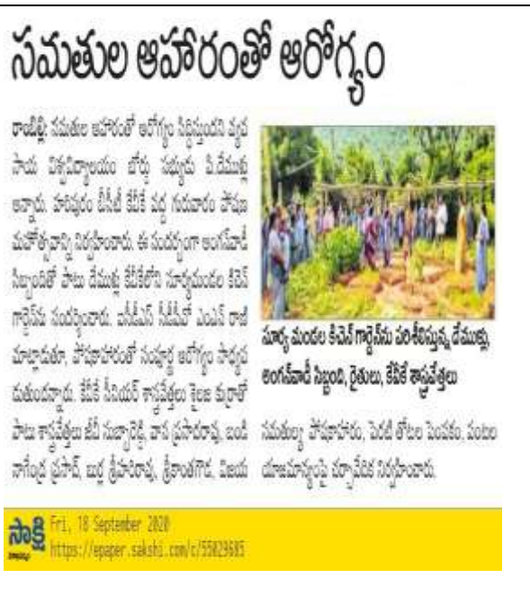
News paper clipping from Hydrabad