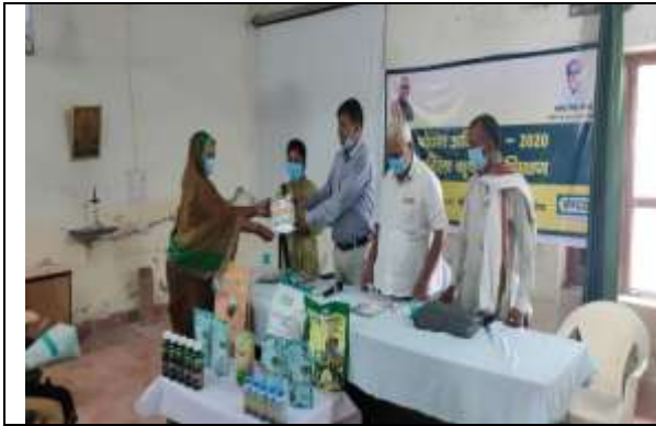
Plant Distribution by KVK Deoria