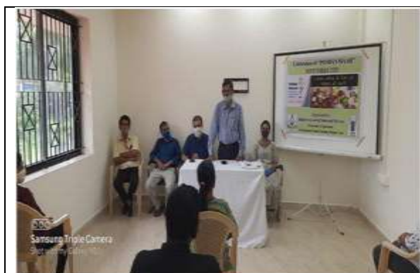
KVK South Goa