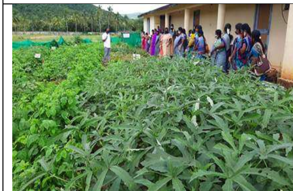
KVK Chittoor (RASS)