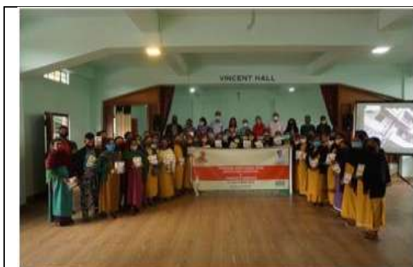
KVK Jaintia Hills