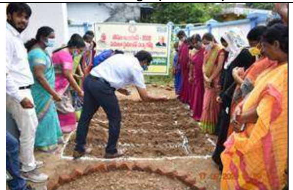
KVK Kammam (Kothagudem)