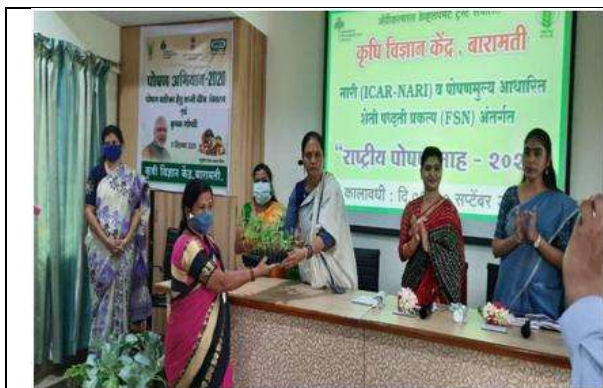
KVK Pune-I distributing Seedlings and planting material to the anganwadi workers.