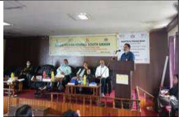
KVK SOUTH SIKKIM