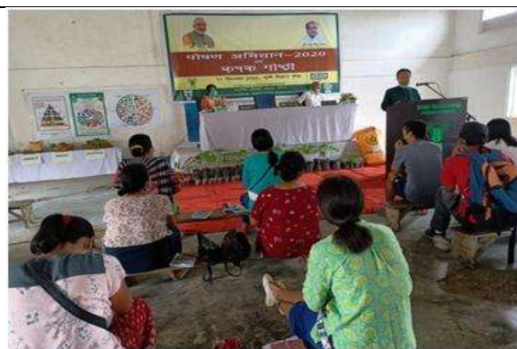
KVK Imphal East