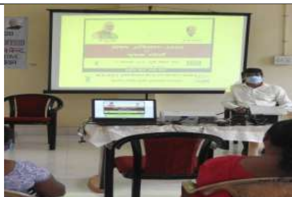
KVK Nimbudera 2