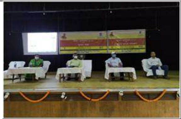
KVK West Tripura