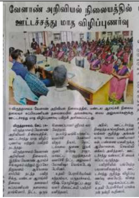
News paper clipping from Hyderabad