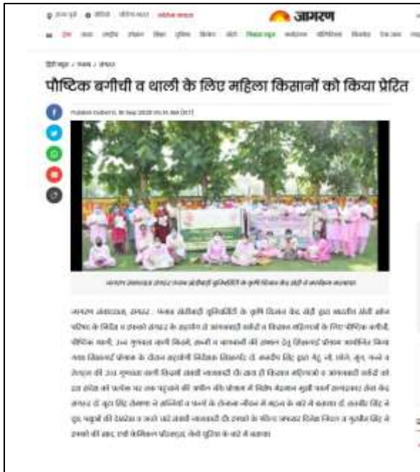
News paper clipping from Punjab