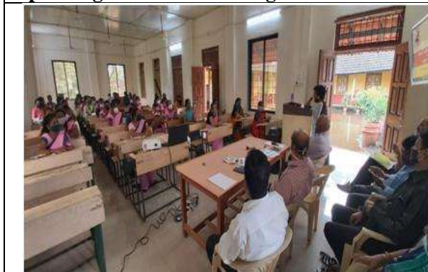
KVK Raigaddelivering lectures on nutrition to anganwadi workers and farm women.