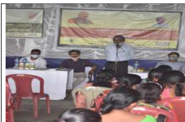
KVK Dakshin Dinajpur