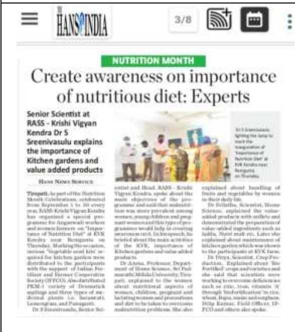
News paper clipping from RASS KVK (Hydrabad)