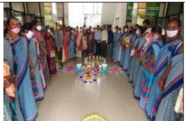
KVK West Godavari