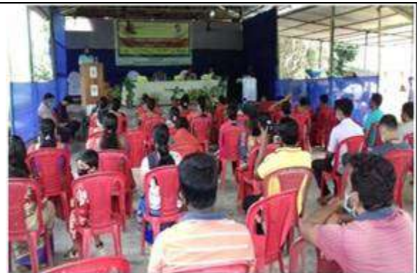
KVK South Tripura