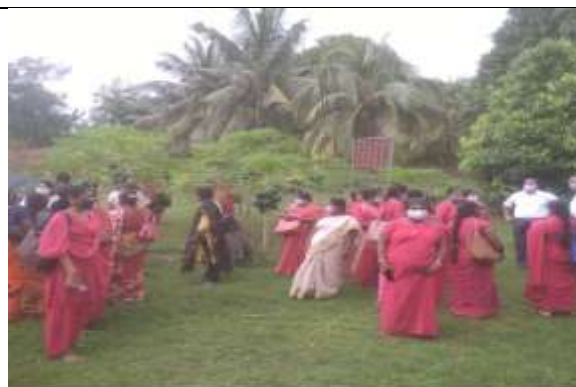
KVK Port Blair