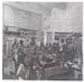
कृषि विज्ञान केंद्र पर पोषण वाटिका के लिए आंगनबाड़ी कार्यकर्ताओं को बीज के पैकेट बांटे जा रहे हैं।

कृषि विज्ञान केंद्र का राष्ट्रीय पोषण अभियान कार्यक्रम के अंतर्गत कानपुर का राष्ट्रीय पोषण केंद्र भी इस अभियान में भाग ले रहा है। कृषि विज्ञान केंद्र के अध्यक्ष डॉ. राजरा नूतन देवा ने कहा कि इस कार्यक्रम के तहत आंगनबाड़ी कार्यकर्ताओं को बीज के पैकेट बांटे जाएंगे।