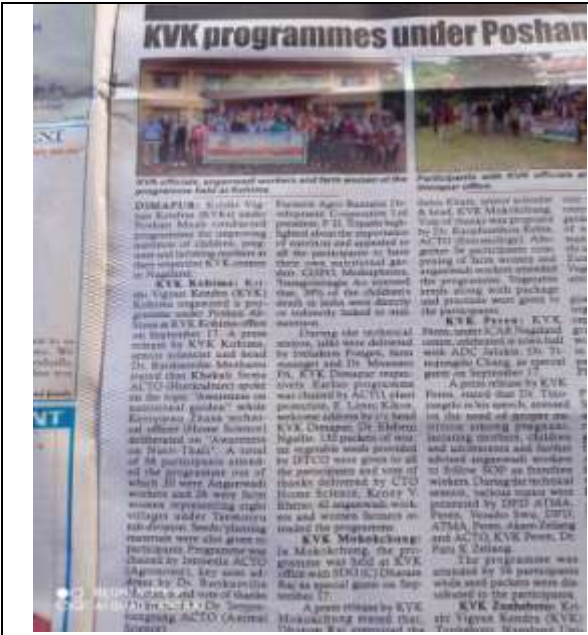
News paper clippings from Nagaland