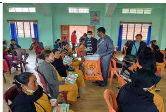
KVK East Khasi Hills