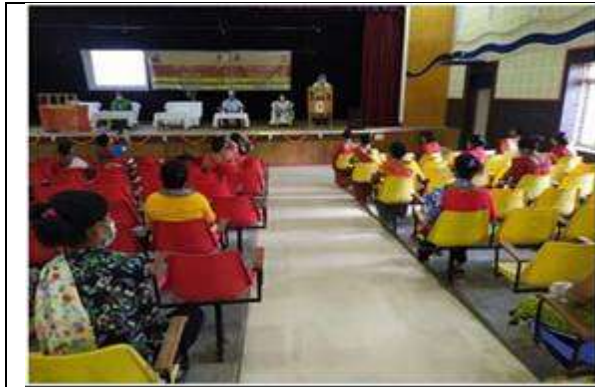
KVK West Tripura