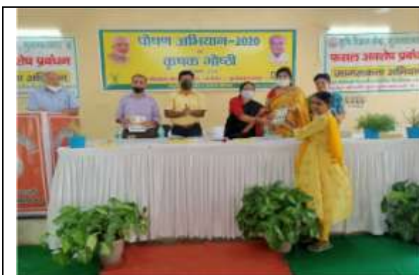
Seed Distribution by KVK Mujaffarnagar