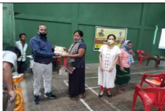
Seed Distribution by KVK TIRAP