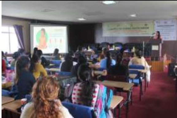
KVK SOUTH SIKKIM