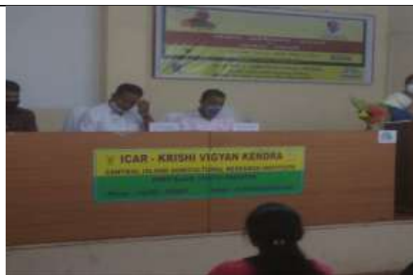
KVK Port Blair