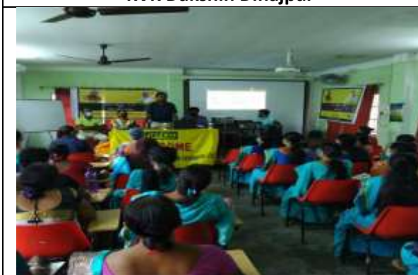
KVK Uttar Dinajpur