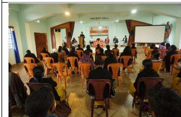
KVK West Khasi Hills