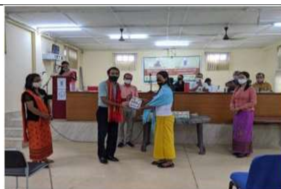
KVK East Garo Hills