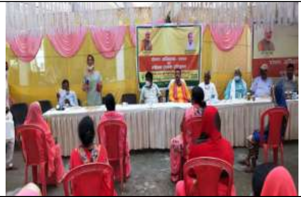
Seed Distribution by KVK Gonda