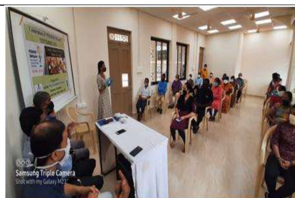
KVK South Goa