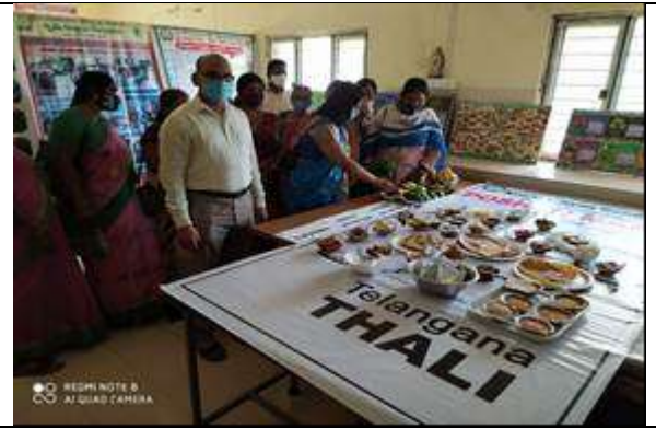
KVK Warangal (Mamnoon)